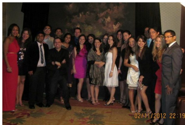
MCH Pediatric Residency Program at the Annual Gala