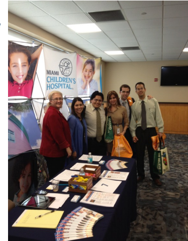
MCH Medical Education Team Showcasing the Residency Program at the FIU Residency Fair